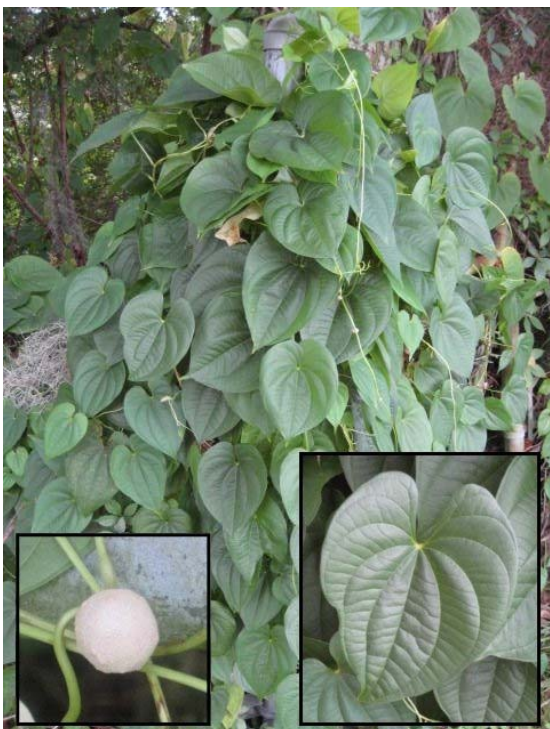
Air Potato Vine

University of Florida Center for Aquatic and Invasive Plants and the Florida Exotic Pest Plant Council (FLEPPC)