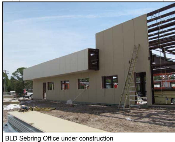
BLD Sebring Office under construction

In the Energy category, CSI used several different strategies to increase the energy efficiency of the building beyond what is required by the Florida Building Code. The exterior walls and roof are being constructed using insulated metal panels with additional standard batt insulation, yielding a building envelope that has twice the required "R-value." The windows have insulated, Low-E type glazing with a Solar Heat Gain Coefficient 30% lower than