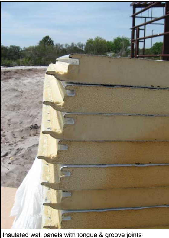
Insulated wall panels with tongue & groove joints