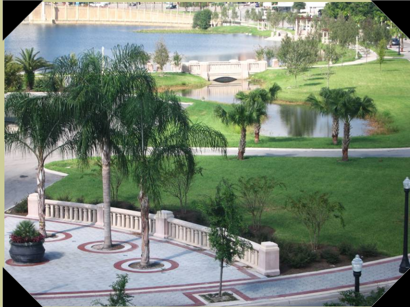
Stormwater pond designed to flow under bridged walkway to the lake.

Additional related projects, which will be completed in a domino effect, are the In-Town Bypass Park & Ride Lot, and the Massachusetts Avenue Streetscape. These projects were combined by the City into one construction contract in order to achieve greater cost efficiency.