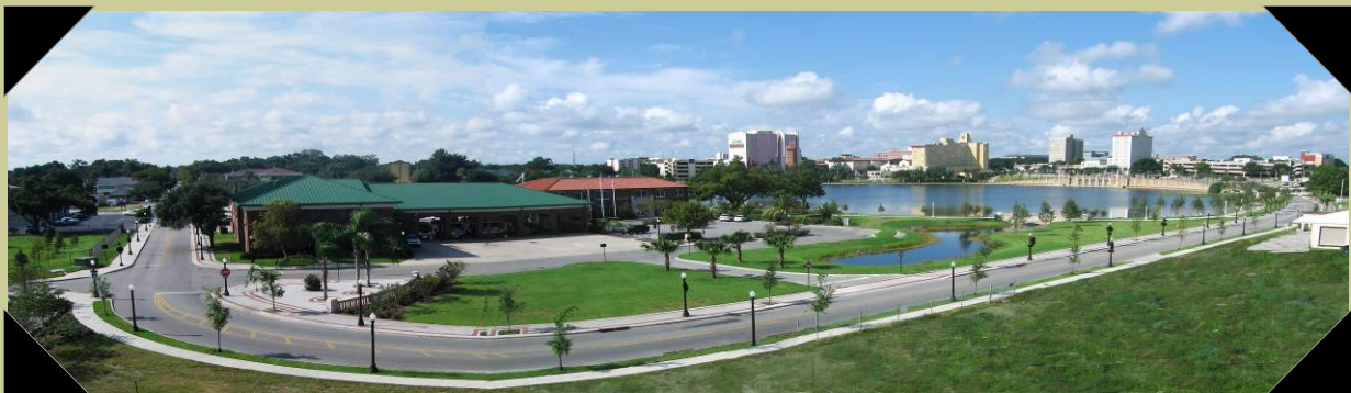
Re-aligned Main Street flows along the north side of Lake Mirror and around the Fire Station.

of Lake Mirror. Streetscaping, historic lighting, and the construction of Main Street from Massachusetts Avenue to Lake Parker Avenue are all part of the total project package. The final promenade construction along Main Street connects several existing parks encircling the lake, making it the crown jewel of the City's already amazing park system.